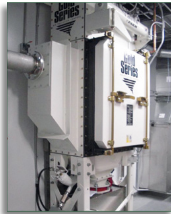
Gold Series Camtain

Safe-change containment systems are available for both the filter cartridges and discharge system. The cartridge change utilizes a bag-in/bag-out (BIBO) method while the discharge uses continuous liner technology. The Gold Series can also support traditional dust collection for nuisance dusts and fumes that do not require full isolation and containment. Camfil APC has contained and noncontained dust collectors for pharmaceutical applications in the Americas, Asia and Europe.