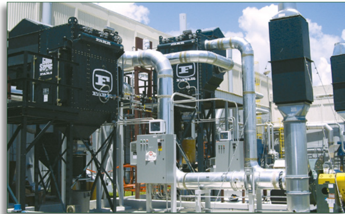
Potent Compound Containment Collectors